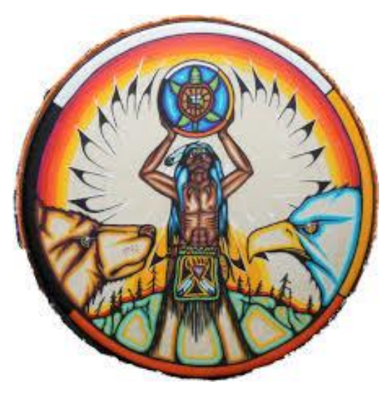
An Abenaki Legend

It is said that when Creator was giving a place for all the spirits to dwell who would be taking part in the inhabitance of Mother Earth, there came a sound, a loud BOOM, from off in the distance.