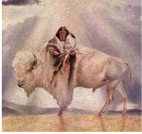
Spírít of White Buffalo

White buffalo walked from the west, her large eyes watching the grass that covered the endless plains as it waved in the breeze, like strands of golden hair stirring with the gentle touch of unseen hands.