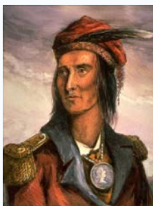
Tecumseh - Shawnee

In war they have leaders and war-chiefs of different grades. The common warriors are driven forward like a herd of antelopes to face the foe. It is because of this manner of fighting - from compulsion and not from personal bravery - that we count no coup on them. A lone warrior can do much harm to a large army of them - especially when they are in unfamiliar territory.