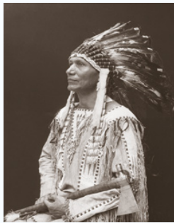
Charles Alexander Eastman - Santee Sioux

They are a heartless nation; that is certain. They have made some of their people servants - yes, slaves! We have never believed in keeping slaves, but it seems that the white people do! It is our belief that they painted their servants black a long time ago, to tell them from the rest - and now the slaves have children born to them of the same color!