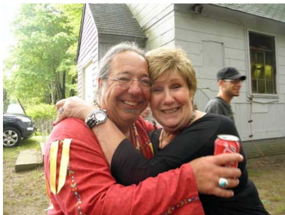
Drummer, Flute Player, Story Teller & Teacher