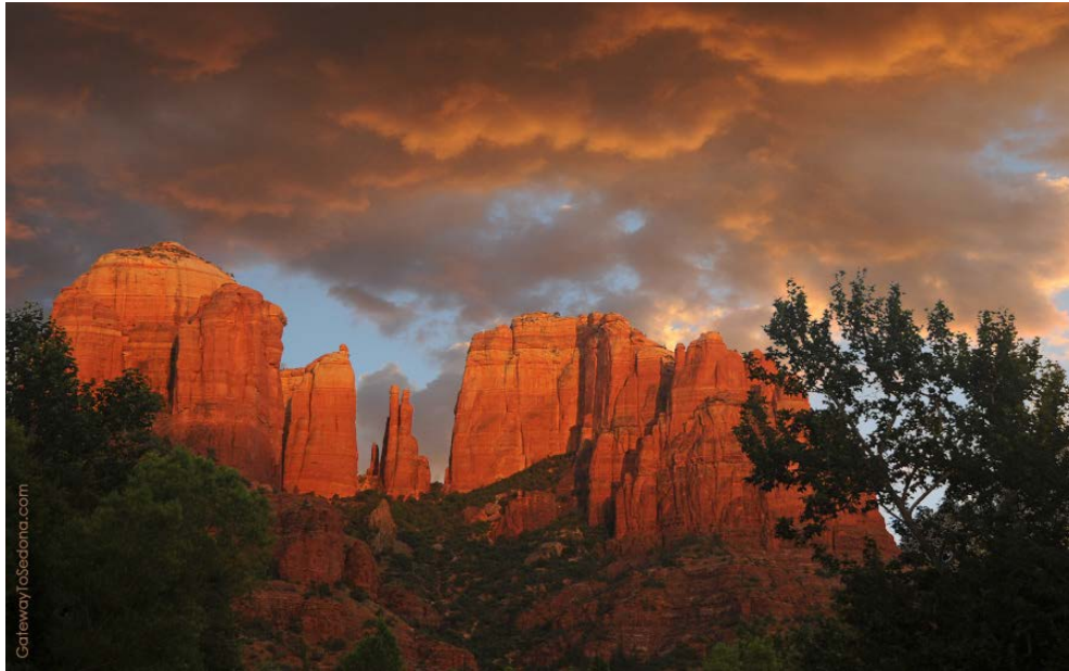
Cathedral Rock in Sedona, Arizona