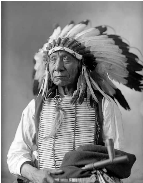
Chief Red Cloud, Oglala Sioux

“The white man made us many promises, more than I can remember. Promises they did not keep. They kept but one - They promised to take our lands... and they took it.”