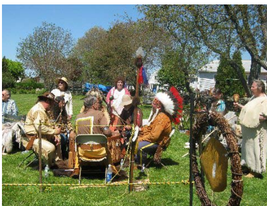
Picture from past Planting of the Corn Ceremony

Outside of it being Easter, this month's big news: the "Planting of the Corn" ceremony. This will be our 4 th year performing this Cherokee style ceremony. Along with the Corn ceremony, we will have a Pipe ceremony, and if the weather permits, the circle will be open for dancing. Let's hope for good weather. { * notice the rain date } ----->